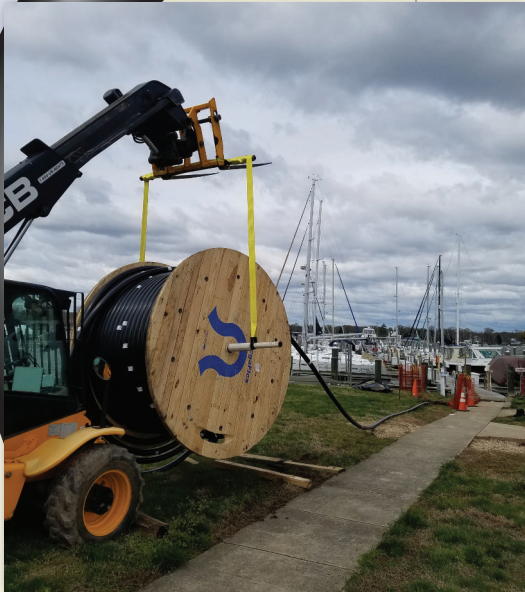
DoubleTrac is shipped on a robust 80" reel with a 3" arbor hole, allowing the pipe to be unrolled using normal construction equipment.

Marina owners are spending huge sums of money complying with the newest petroleum/ marina state and local codes. Owners in the state of Maryland can rest assure if they want a superior UL971A listed double containment piping system, installed with the least amount of down time to their marinas. They should contact Tank Systems Services LLC. and ask for Leon.