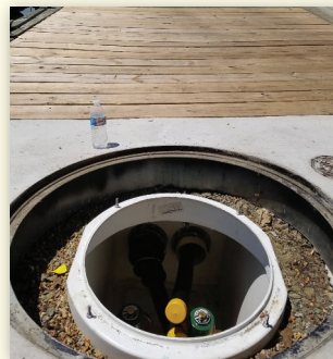
Due to DoubleTrac's Stainless Steel primary and Nylon 12 outer jacket, DoubleTrac Pipe instantly relaxes once off the reel.