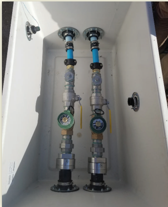
DoubleTrac's patented field attachable fittings allows an easy transition from existing fuel pipes.