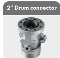
2" Drum connector