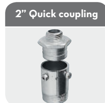
2" Quick coupling